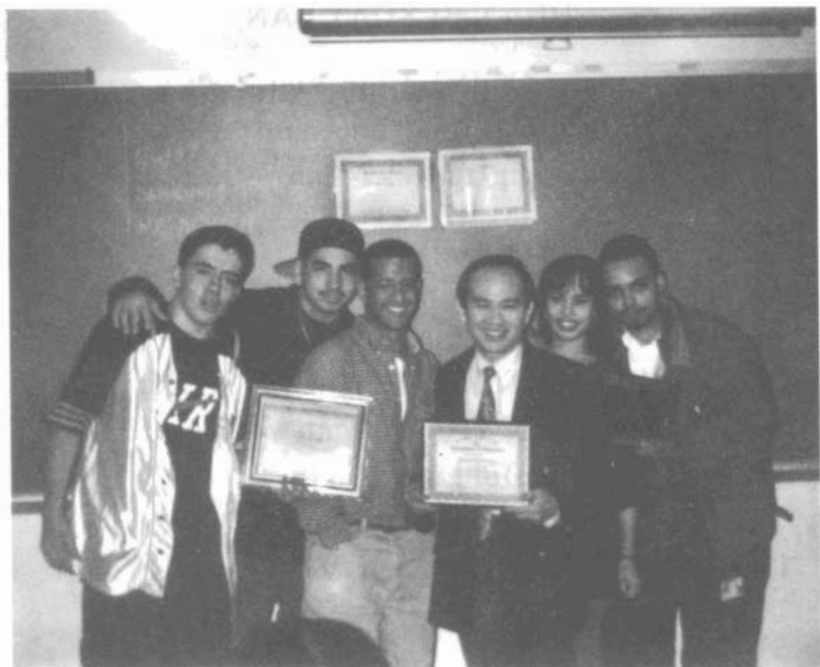
Đạy Anh văn thương mại ở New Jersey , 1977