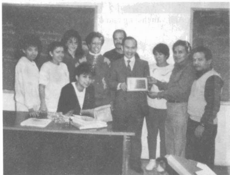
Dạy Anh Văn giao tiếp ở thành phố New York, 1989

Tựa Bài & Tác Giả Tân Nhạc Việt Nam (sưu tầm)