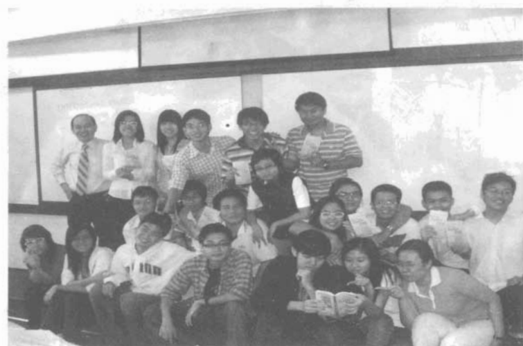
Đạy Anh văn ở Đại Học Quốc Tế, Thủ Đức, 2009