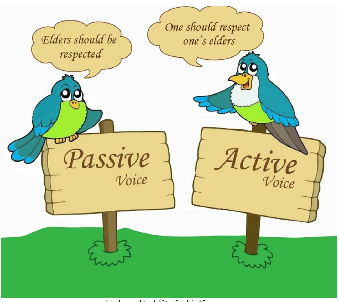
các dạng đặc biệt câu bị động