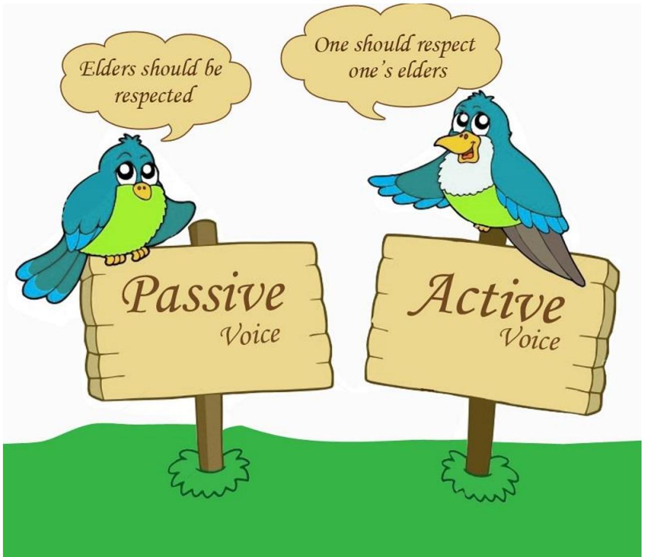
các dạng đặc biệt câu bị động